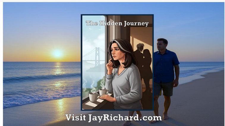
Scene from the “Hidden Journey” chapter of When Hope Feels Lost.